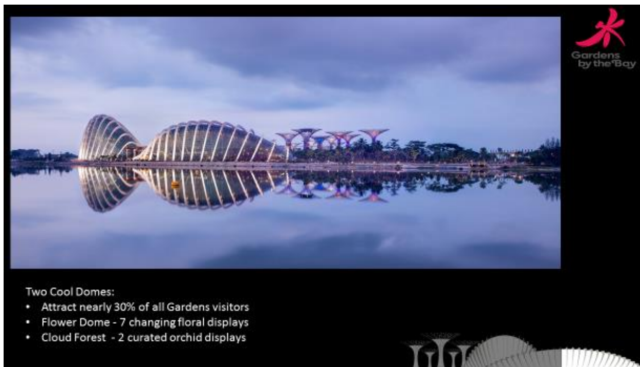
Figure 3. View of the two conservatories at Gardens by the Bay in Singapore: Flower Dome and Cloud Forest.