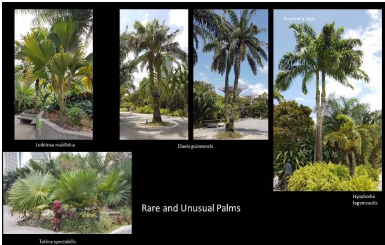
Figure 2. Rare and unusual palms in the outdoor gardens at Gardens by the Bay in Singapore.